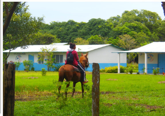
New structure of the school

3.2. The school is offering today Kindergarden, Primary and Secondary School.