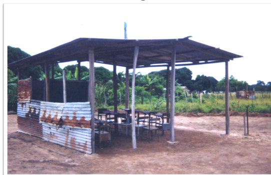
The school in 2002

In 2002, the school was composed of what you can see in the image below and counted 12 students, un 17 years-old teacher, and one single class.