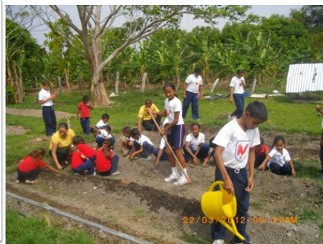
The vegetable garden or orchard