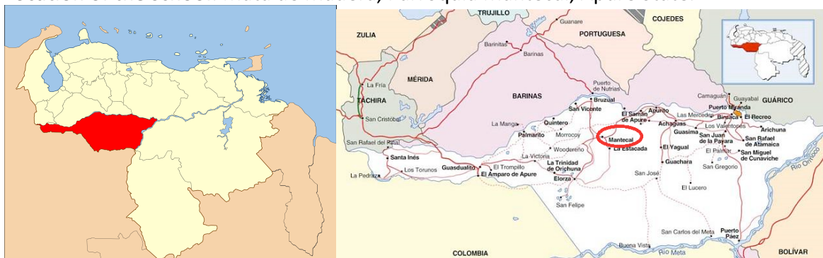
Location in Apure, Venezuela

Location of the school: Mata de Madera, Parroquia Mantecal, Apure State.