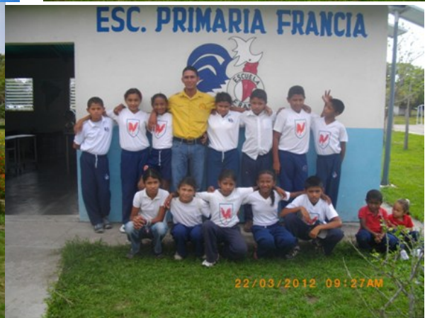
3.3. Children are offered a meal through a project called Programa de Alimentacion Escolar (PAE) .